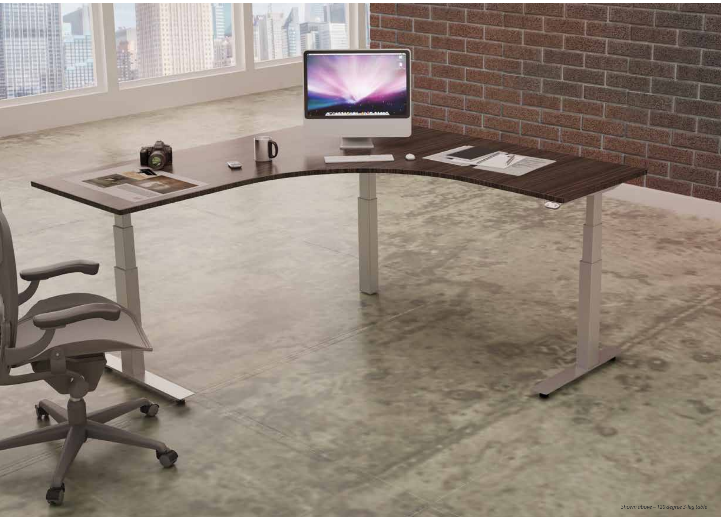
Shown above – 120 degree 3-leg table