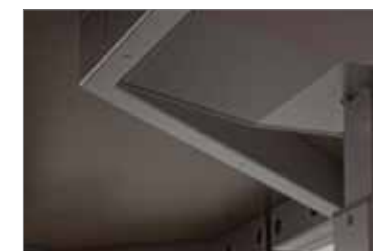
Hidden frame elements provide unmatched support with keyboard arm compatibility, and the frame is width adjustable so one base fits tops from 48" to 84".