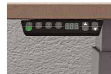
Optional digital read out memory switch allows up to four user-programmable height settings.