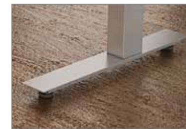
Euro-inspired flat low profile foot creates a sleek modern aesthetic.