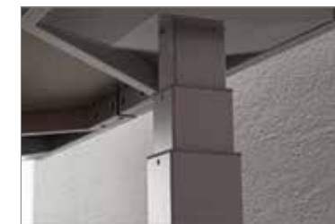
Three-stage legs smoothly and silently to adjust the work surface height from 22" to 48".