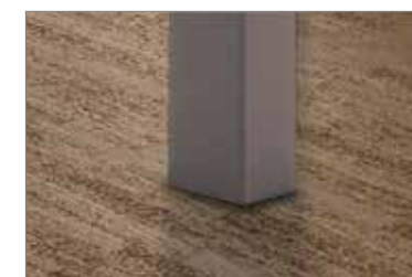
Three-leg tables feature a foot-free center leg to enhance design symmetry.