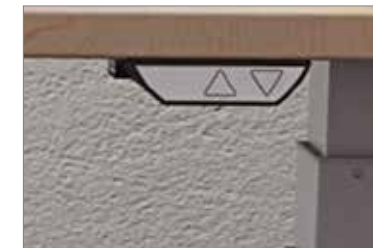
Standard up/down switch moves the work surface with push button ease.