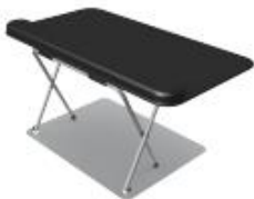
Scissor Lift 21" SLO21