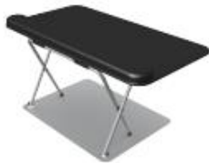
Scissor Lift 24" SLO24