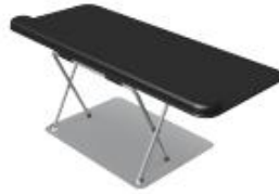
Scissor Lift 27" SLO27